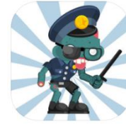
Math Vs Zombies Free (iOS) Free (Google)