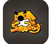
Sumdog Free (iOS) Free (Google)