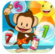
Monkey Math School Sunshine £1.99 (iOS) £1.79 (Google)