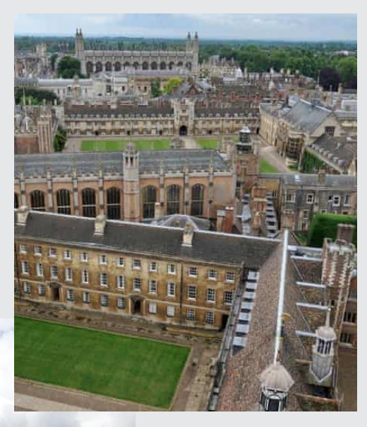
City Collegiate Campus