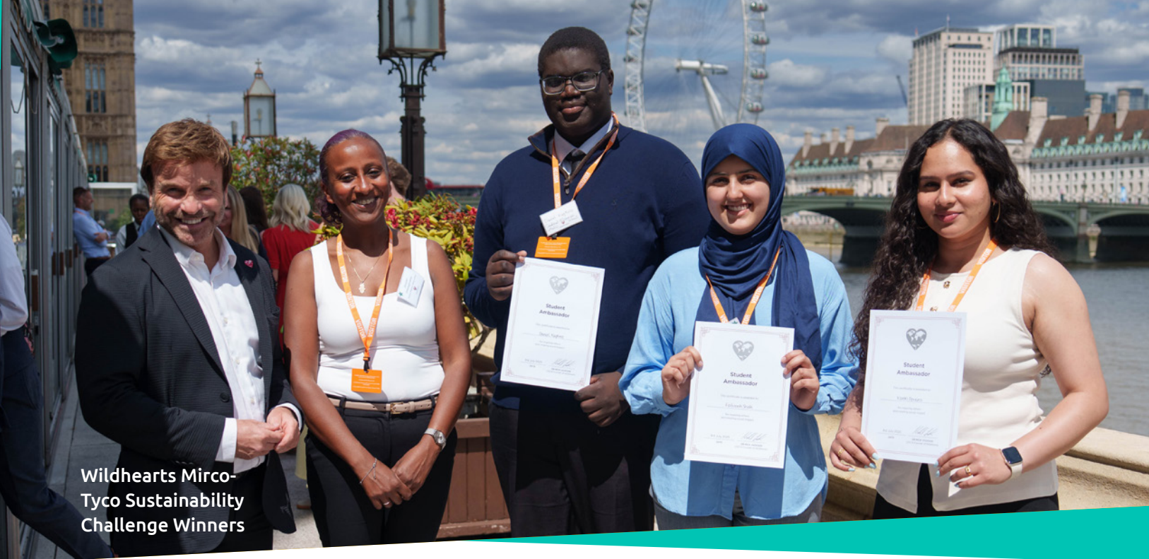
Wildhearts Mirco-Tyco Sustainability Challenge Winners